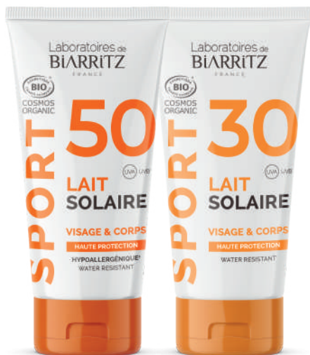
SUNSCREENS LOTIONS FACE & BODY 50ml Tube

PROVEN NON-TOXICITY FOR MARINE ECOSYSTEM