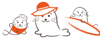
For the whole family