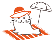
Baby & Children

According to the age of the children and the needs of the parents, two categories are possible: