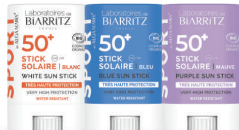
SUNSCREENS STICKS FACE & BODY 12 gr Sticks