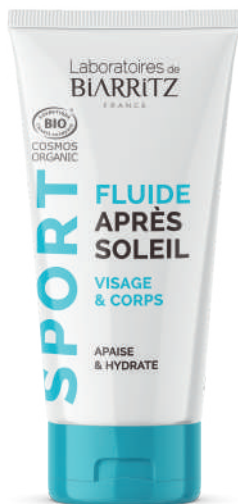
AFTER SUN FLUID FACE & BODY 50ml Tube